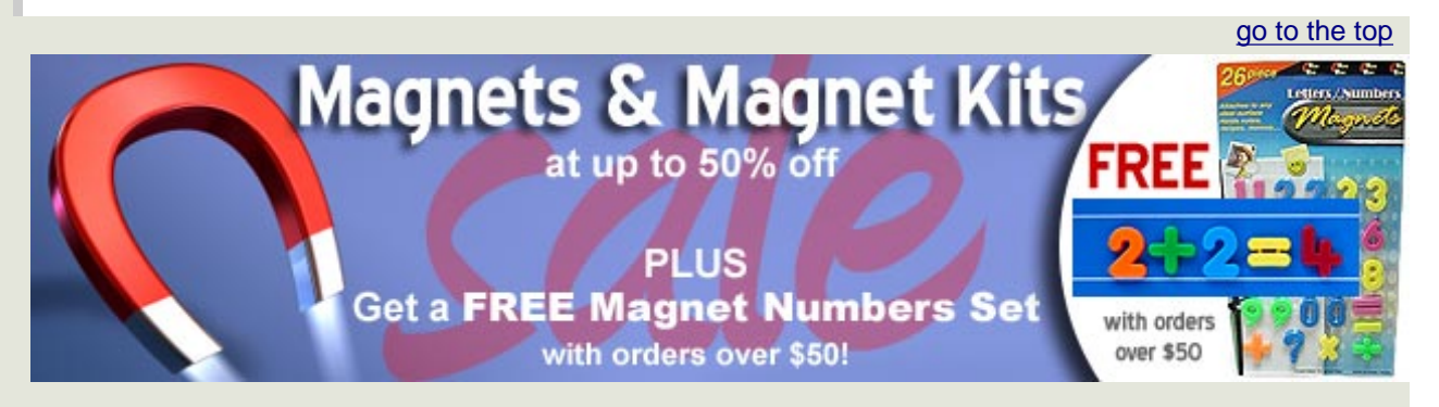
All rights reserved. © Copyright '1995-'2007 PhysLink.com

Click here to view other physics & astronomy related products from our online store.